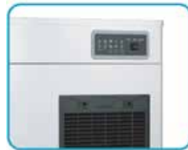
Easy to check and control by the front display