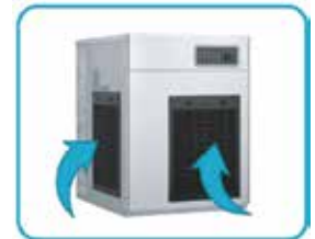
Front & Left In / Rear Out Air Flow