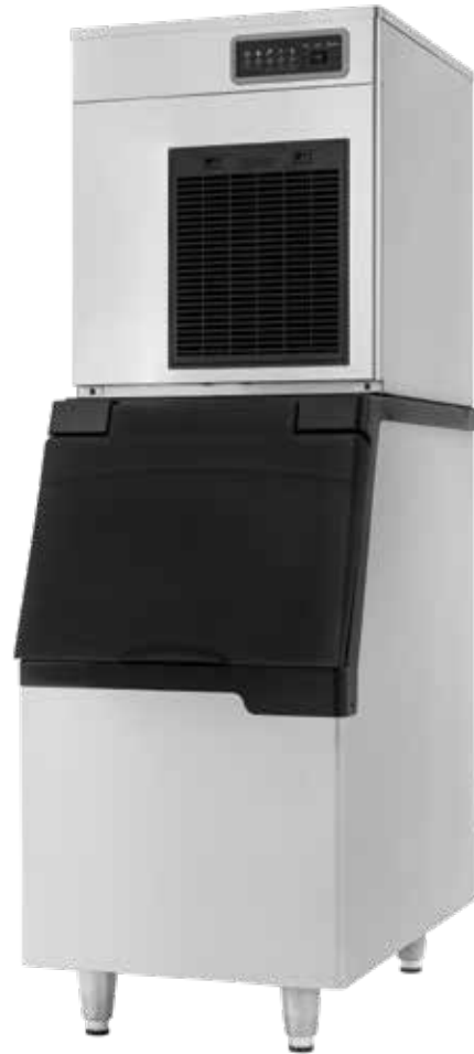
IM-0770-AN shown with IB-026-22

※ Bin top adapter needed to use IB-033/044 (30" Bins) IBT-2230R: 8" Bin top adapter to left mount 22" Head on IB-033/044 IBT-2230B: 4" (2) Bin top adapters to center mount 22" Head on IB-033/044