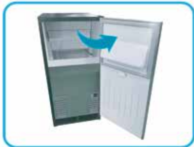
Easy to scoop Ice