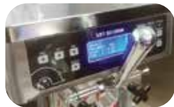
LCD DISPLAY PANEL