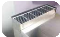
AIR DISCHARGE ON TOP