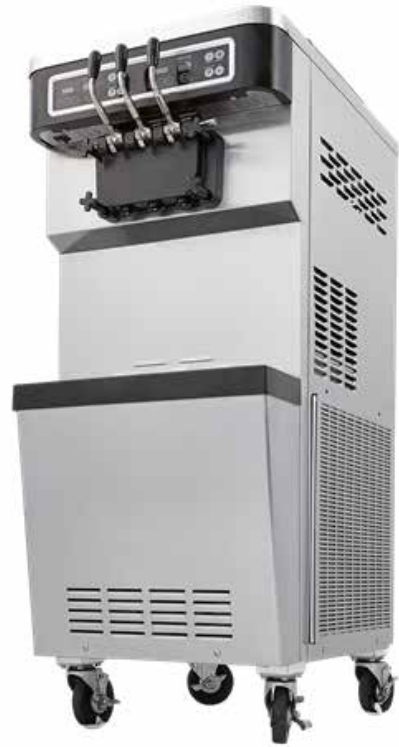
ISI-303SNA / SNAP (Air Cooled) ISI-303SNW / SNWP (Water Cooled)

Air pump increases over-run which makes soft serve ice cream smoother and softer