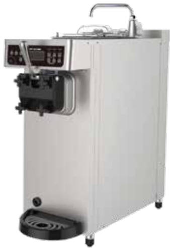
ISI-161TH (Heat Treatment) ISI-161TI (w/o Heat Treatment)