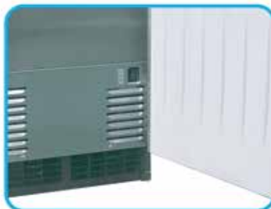
Power switch at the bottom right when the door open