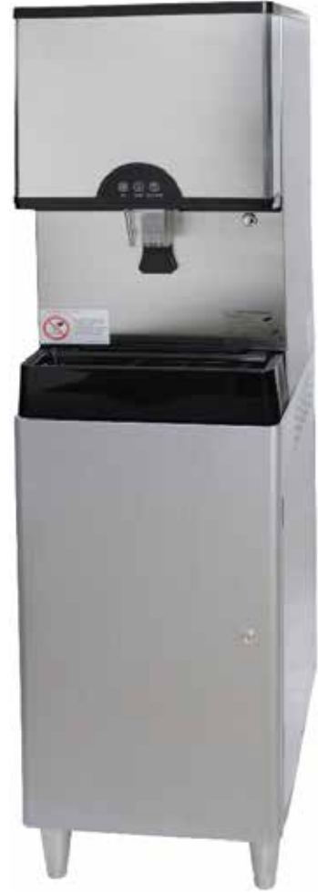
IDS-0350 Stand Shown with a ID-0300-AN