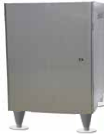
IDS-0450 with flanged legs